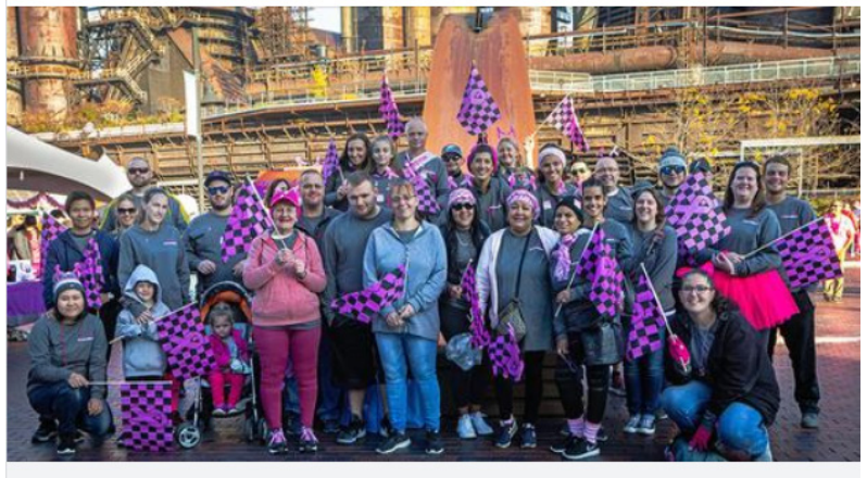
INNOVATIVEWORKSPACES.COM Innovative Makes Strides Against Breast Cancer Our Innovative team united to make strides against breast cancer. This pa...

This past weekend, Innovative employees participated in the Making Strides of Lehigh Valley Breast Cancer Walk, raising over $3,000! We're proud to support breast cancer patients, survivors and their caregivers. http://ow.ly/N3m050wXpDZ